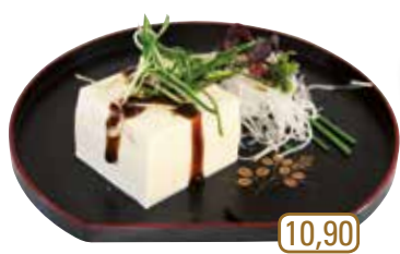
S615 Fresh tofu with salad and dark sauce s 10,90