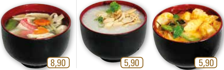
11 Sam-Sien soup with crab, chicken and vegetables a 8,90