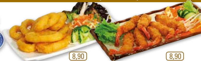
14a Battered crispy calamari with sweet chilli sauce (7 pcs.) g,w 8,90