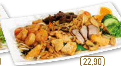
134 Pho-xao-bo: Fried big noodles with beef, green vegetables s,6