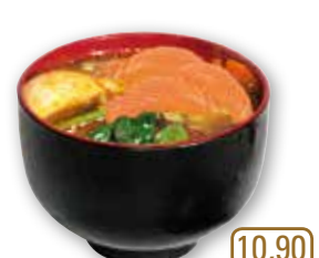
154 Salmon soup with Asia herbs and vegetables f 10,90