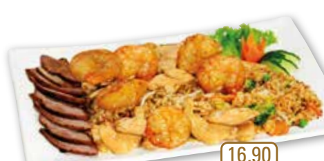
44 Fried rice with shrimps, chicken and grilled pork a,s 16,90

You can also order our food to take away. We do not use flavor enhancers.