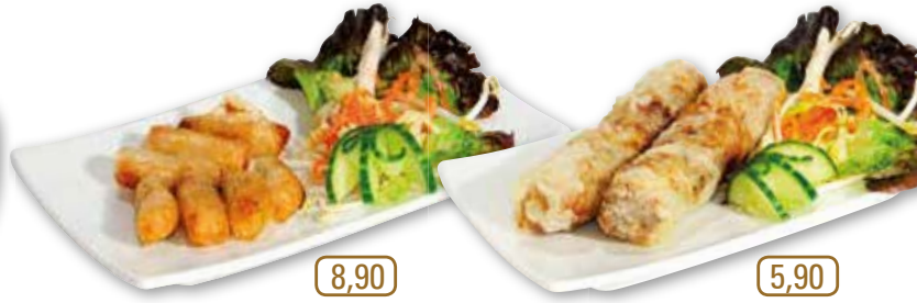
17 Prawn spring rolls with salad (7 pcs.) a 8,90