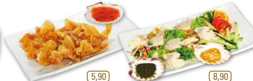
20 Wonton (8 pcs.) deep fried with sweet chilli sauce g 5,90