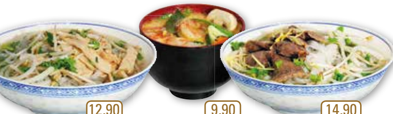
131 Pho-ga (Hanoi): big noodle soup with chicken 12,90