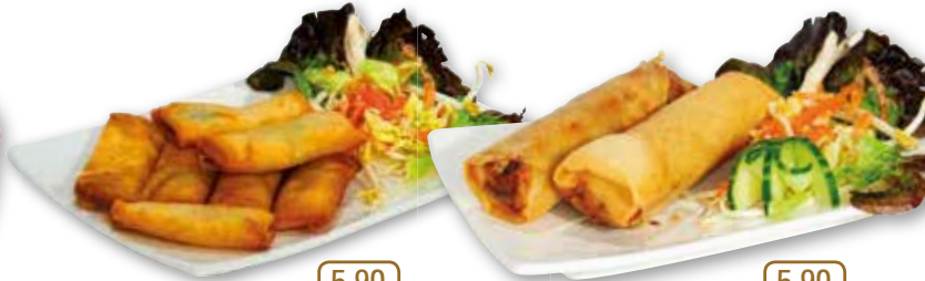
15 Vegetarian mini spring rolls with salad (8 pcs.) g 5,90