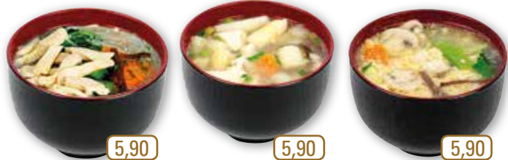
08 Glass noodle soup with chicken or duck and vegetables 5,90