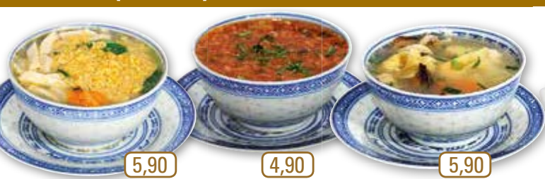
05 Asian noodle soup with chicken and vegetables 5,90