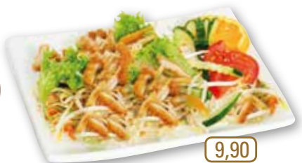
24 Crispy chicken with olive or peanut sauce g,h 9,90