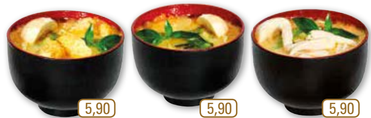
150 TomKa soup with Tofu (Tauhu) s with Thai herbs, coconut milk, mushrooms and lemongras 5,90