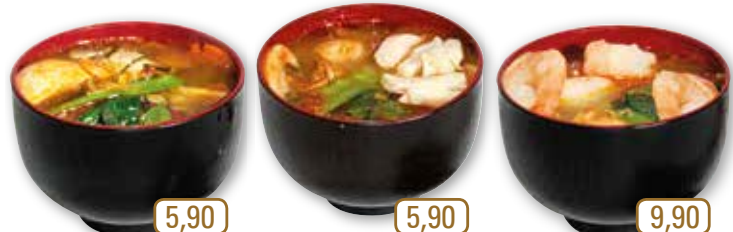
146 Tom Yam soup with vegetables (Pak) with Thai herbs, mushrooms, tomatoes and lemongras a 5,90